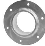
SLF R sleeve

For detailed information, please visit roxtec.com .